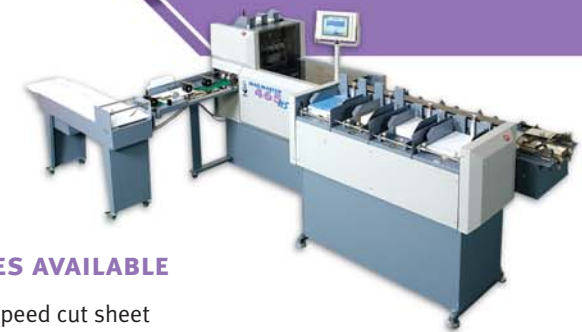
Four station 465HS system