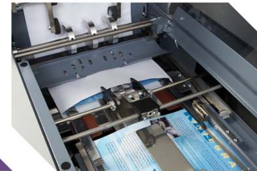
Unique insertion system

Touch screen control of machine operation with a choice of two levels of screen. The simplest level gives station selection, speed control, re-settable counter, help pages, output speed, error location display, and run information. A larger colour screen is available which provides further on screen run information, and facilitates job control, document tracking, data storage and report printing.